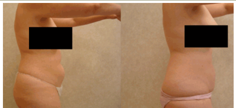
Before Smartlipo® abdomen