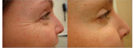
Before Botox® crows feet After Botox® crows feet

A Liquid Face Lift involves the use of advanced dermal fillers such as Juvederm®, Restylane®, Perlane® and Radiesse® usually in combination with BOTOX®. These dermal fillers are among a group of 2nd generation fillers that provide more enduring results than earlier products.