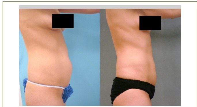
Before Smartlipo Abdomen After SmartLipo Abdomen

For more information about the procedures available at our office, please visit www.cohendermatologyassociates.com or contact us at 203.259.7709